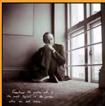
Kevin Spacey (£500 + £25 postage and packaging) - "Sometimes the person who is most logical is the person whom we call insane."