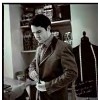
Jimmy Carr (£400 + £25 postage and packaging) - "You live and learn, then you die and forget it all!"