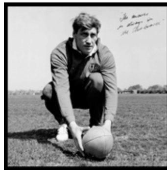
Willie John McBride (£400 + £25 postage and packaging) - "The answer is always on the scoreboard"