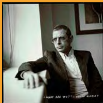
Jeff Goldblum (£450 + £25 postage and packaging) - "What Are You?" - David Mamet"