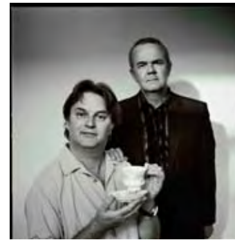
Comming soon ... Ian Hislop & Paul Merton