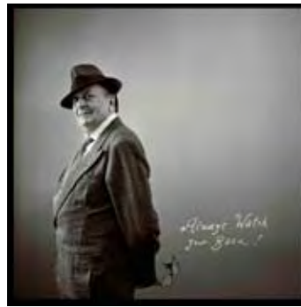
Barry Humphries: (£450 + £25 postage and packaging) - "Always watch your back!"

It's fantastic that so many famous people are supporting Trinity and helping us to raise funds in this unique way. We need to raise nearly £8 million each year to maintain our care services for our patients and their families and we rely on the generosity of people and organisations in our community to achieve this.