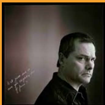
Jack Dee (£400 + £25 postage and packaging) - "Is it me or are you slightly out of focus?"